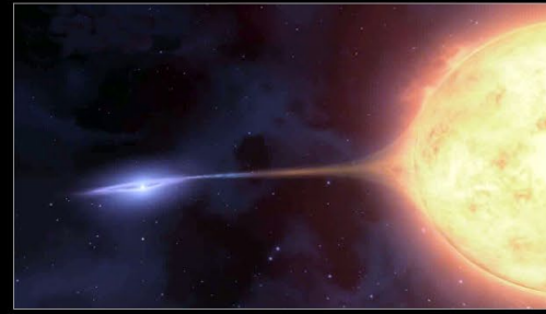
Type 1a Supernova