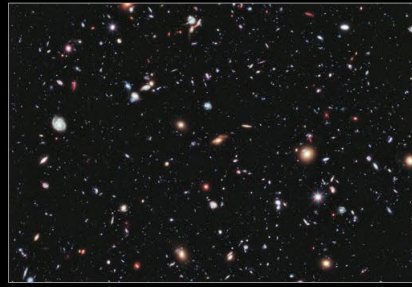
Early Galaxy Formation